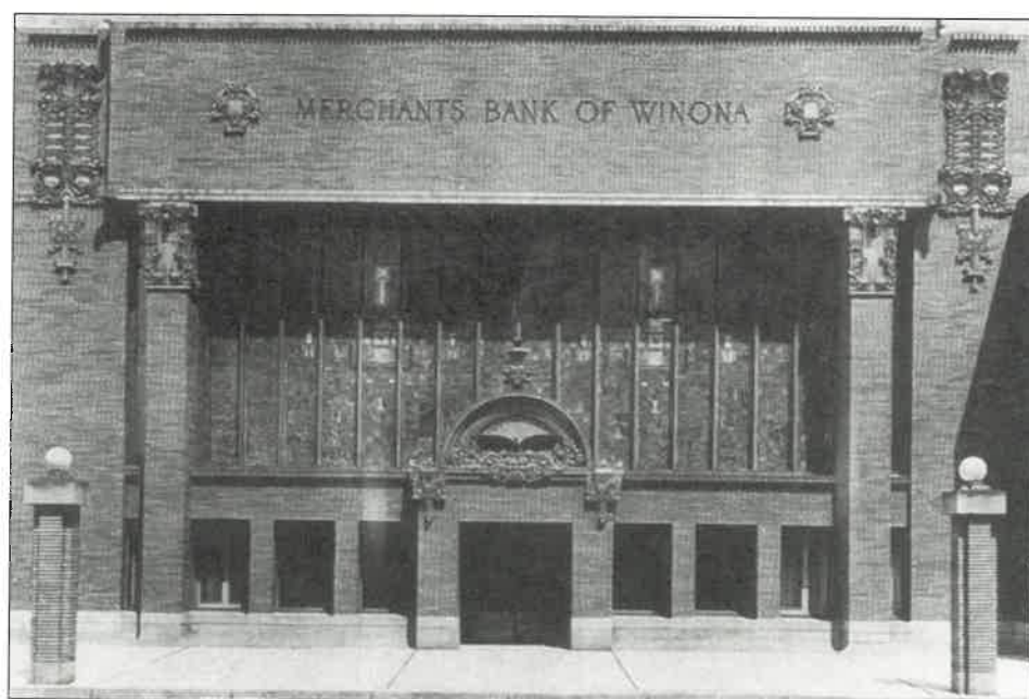
The 1911 Purcell & Elmslie bank from Louis Sullivan: The Function of Ornament , 1986.