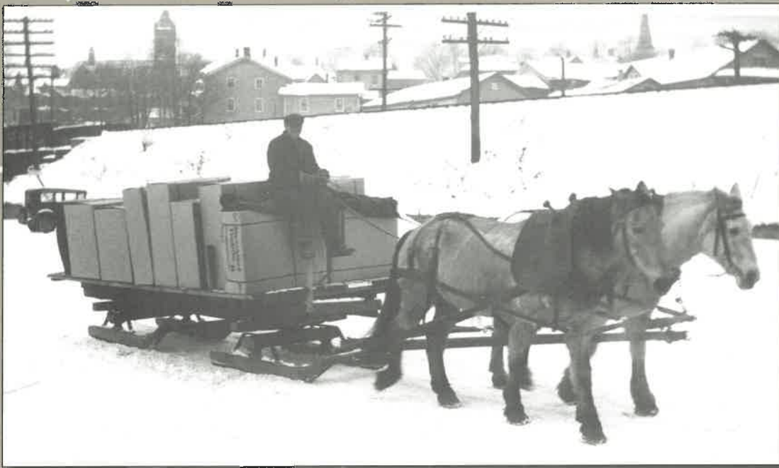
A horse-drawn sleigh on Chandler Street, Jamestown, near the Erie Railroad Freight Station, c. 1935.