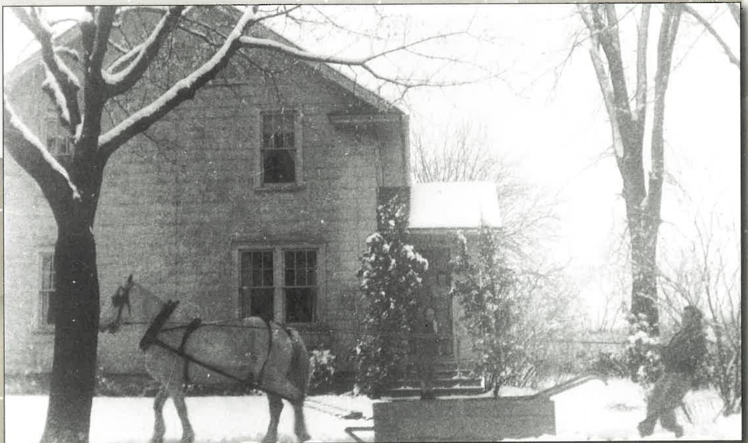
A horse-drawn sidewalk plow on Beechview Avenue at Clyde Avenue, Jamestown, c. 1950.