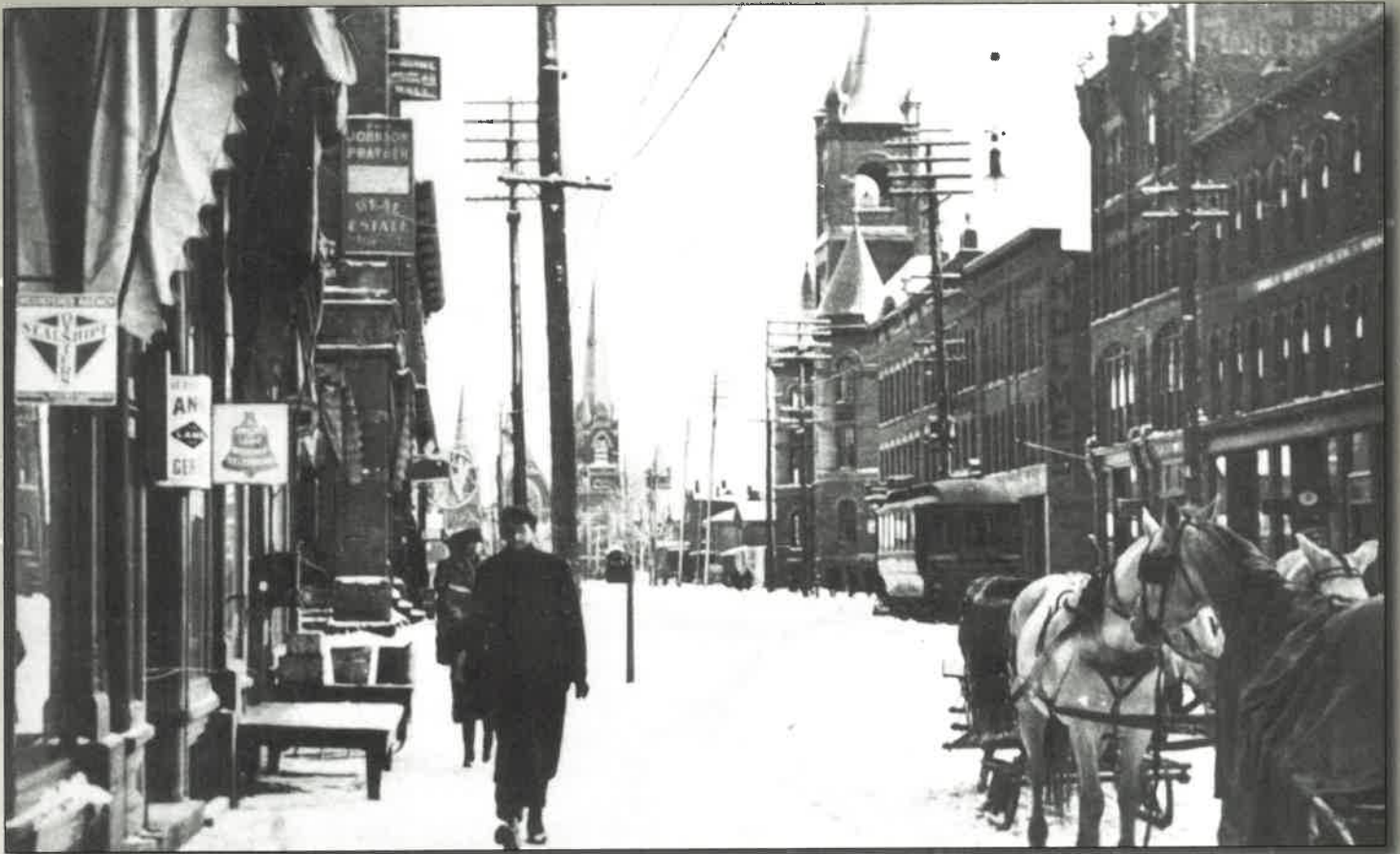
East Third Street, Jamestown, near the corner of Pine Street, c. 1906-09.