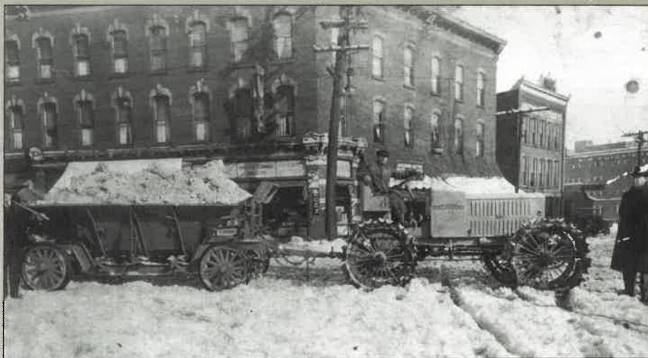
Snow removal efforts in Brooklyn Square, Jamestown, at the corner of Taylor and South Main streets, c. 1920.