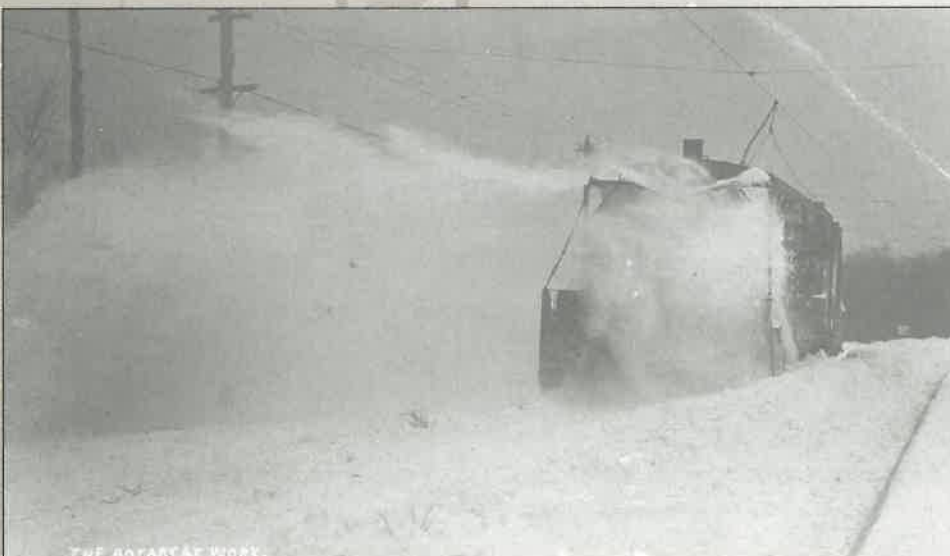
A postcard showing the rotary snowplow at work in Jamestown. The rotary was a large circular set of blades affixed to the front of a train car to cut through snow on the track ahead.