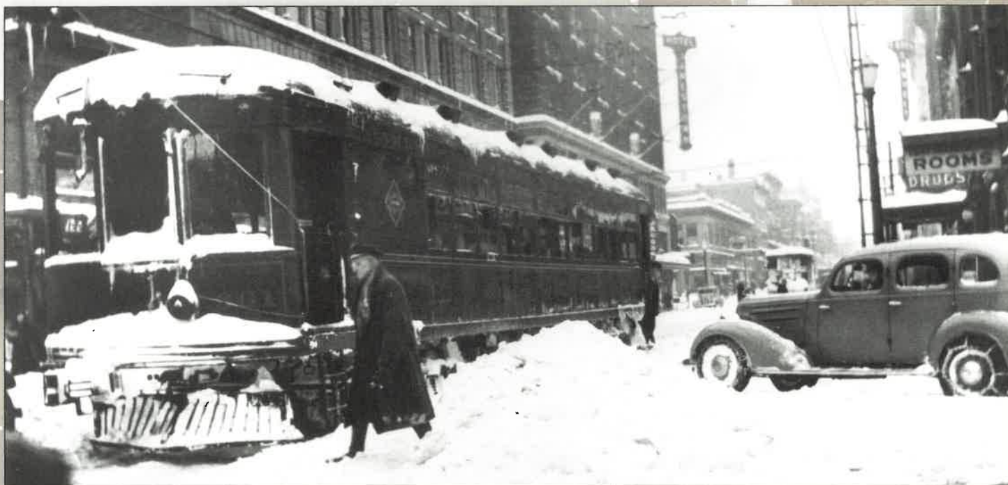
Jamestown, Westfield and Northwestern track running through Jamestown on West Third Street, c. 1935-40.