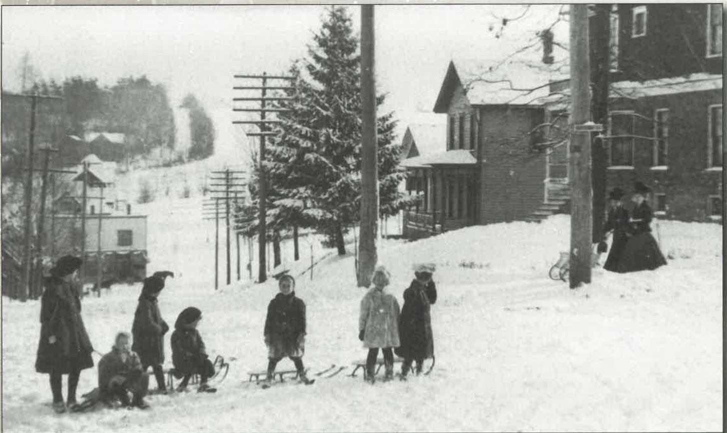
Children sledding at the corner of Newland and Hazzard streets, Jamestown.