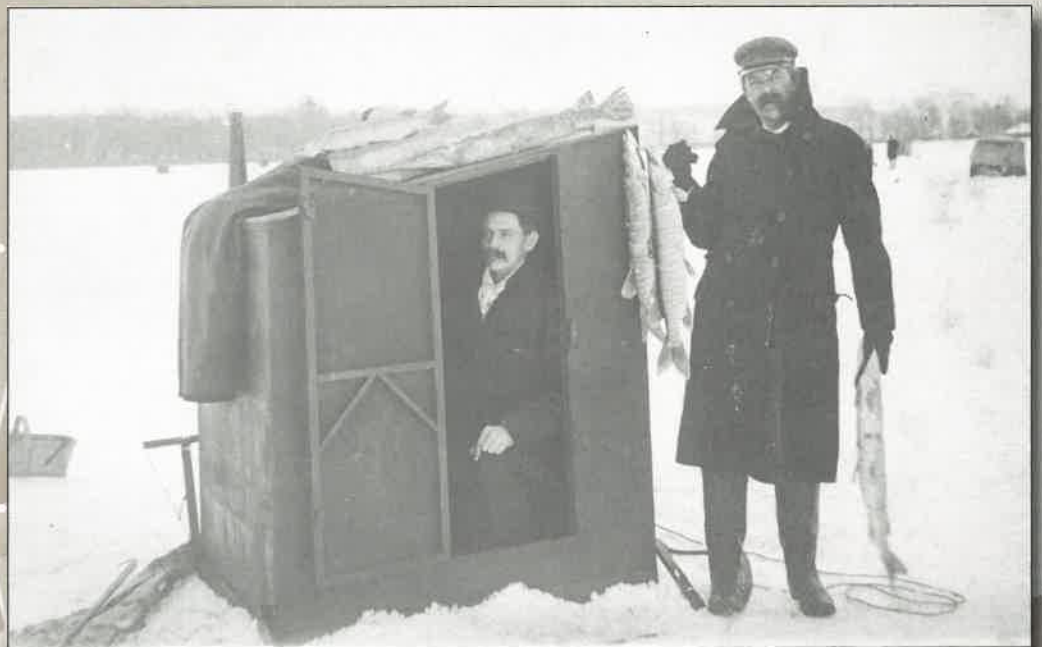
A pair of men admiring their catch at an ice fishing house on Chautauqua Lake.