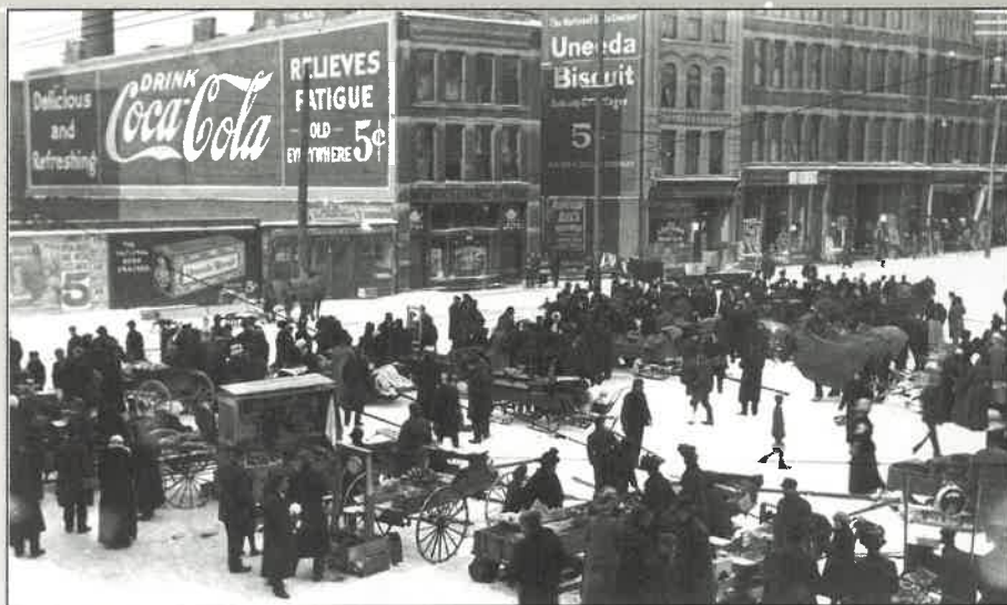
Farmer's Market in Brooklyn Square on South Main Street, Jamestown, in 1910.