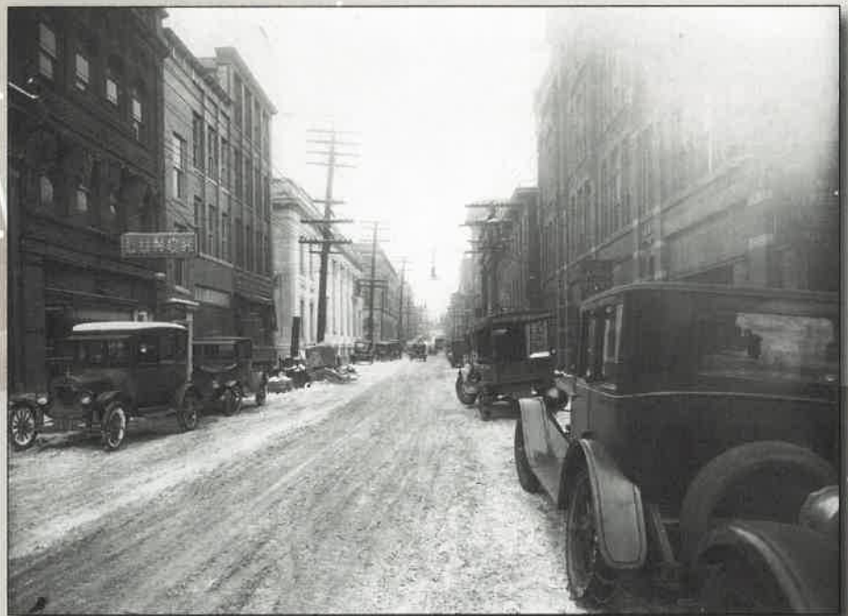
West Second Street, Jamestown, in the early 1920s. Note the chains visible on the car tires to the right.

Governor (1864-69) and a U.S. Senator (1869-75). Governor Fenton's mansion on Washington Street in Jamestown has housed the history center since 1964. The Italian Villa-style home, built in 1863, was designed by Aaron Hall and was placed on the National Register of Historical Places in 1972. 🏠