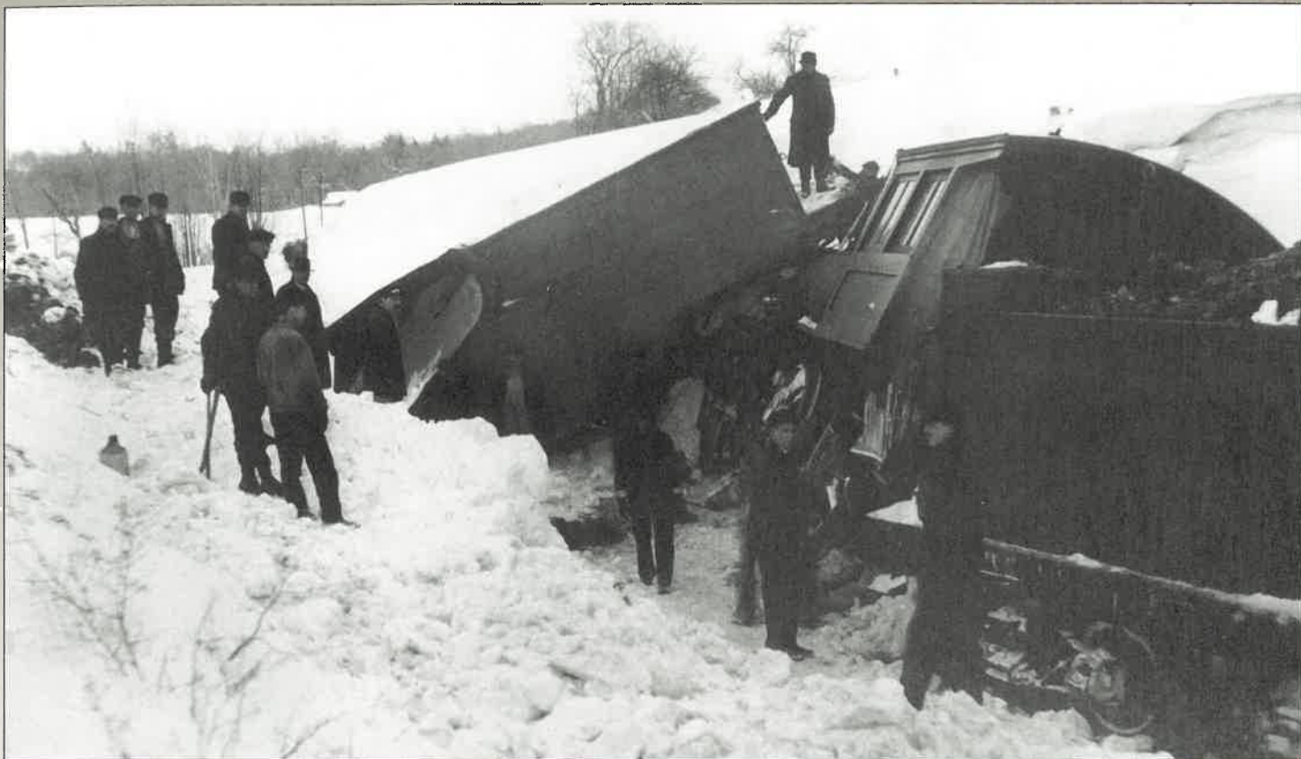
A Jamestown, Chautauqua and Erie Railroad plow has come off the track on Westfield Hill north of Mayville, c. 1935.