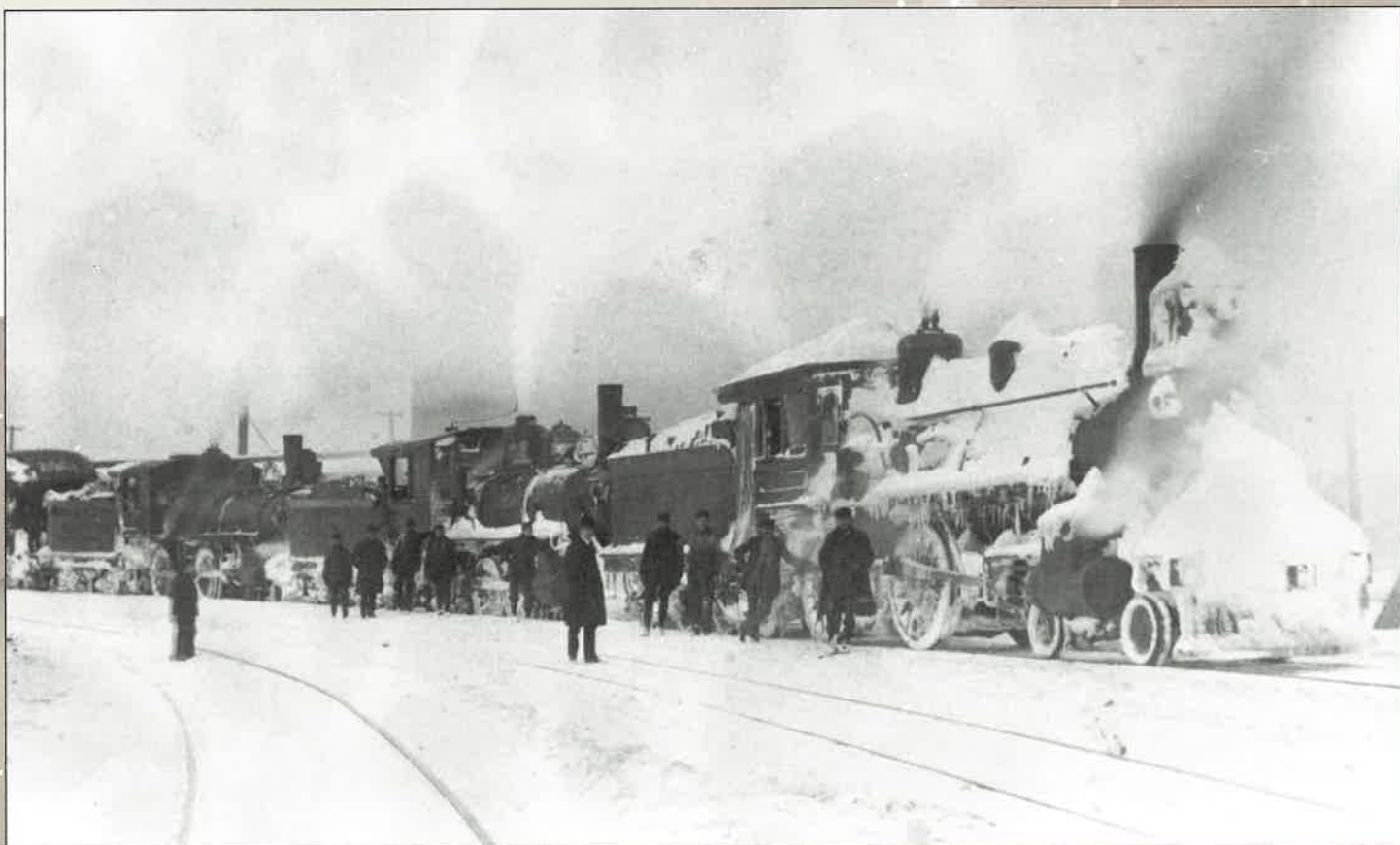
The Jamestown, Chautauqua and Erie Railroad at Boat Landing in Jamestown. Engines #4, #9 and #5 have just returned from fighting the snow, c. 1912.